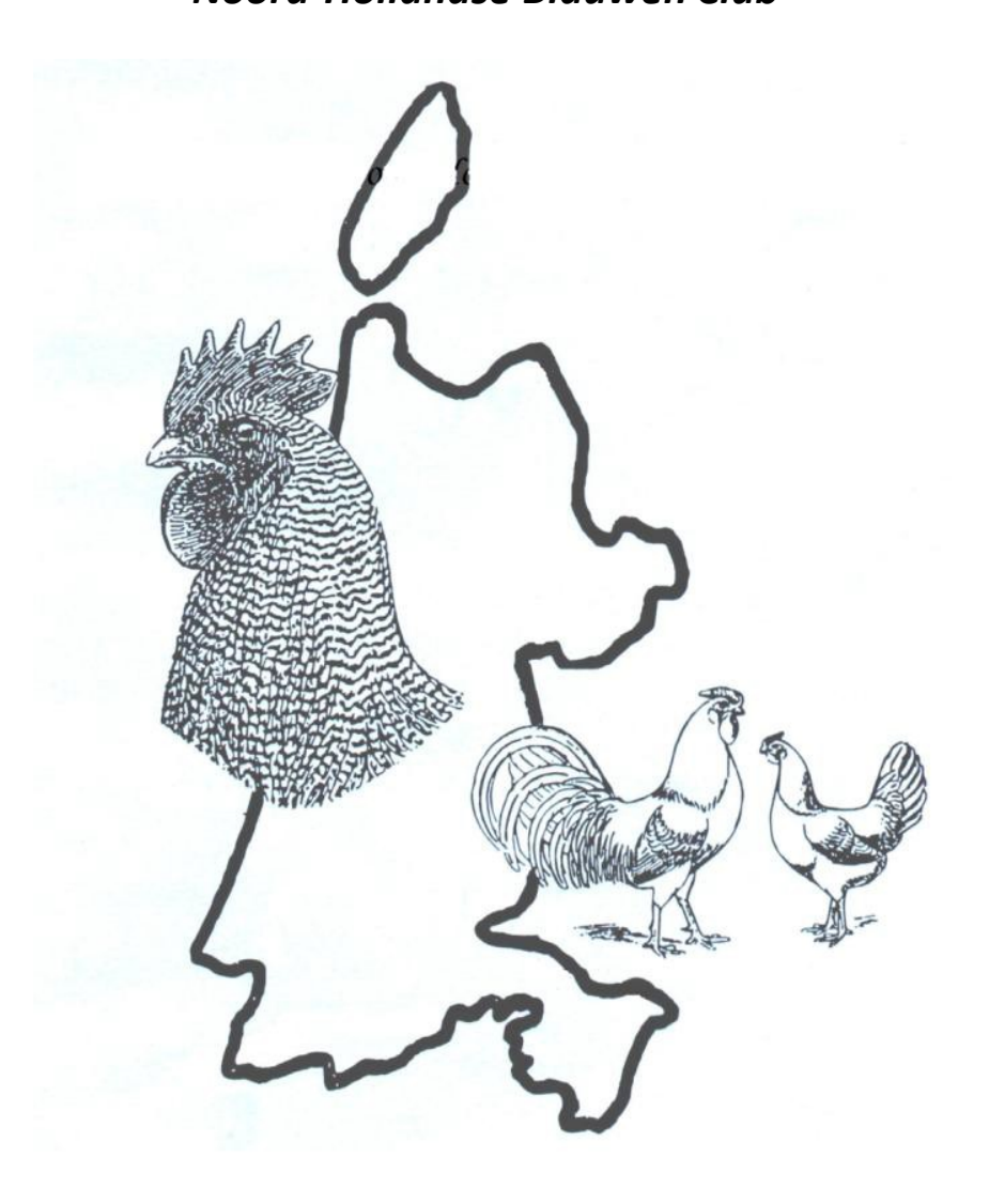
Club magazine number 114 September 2020