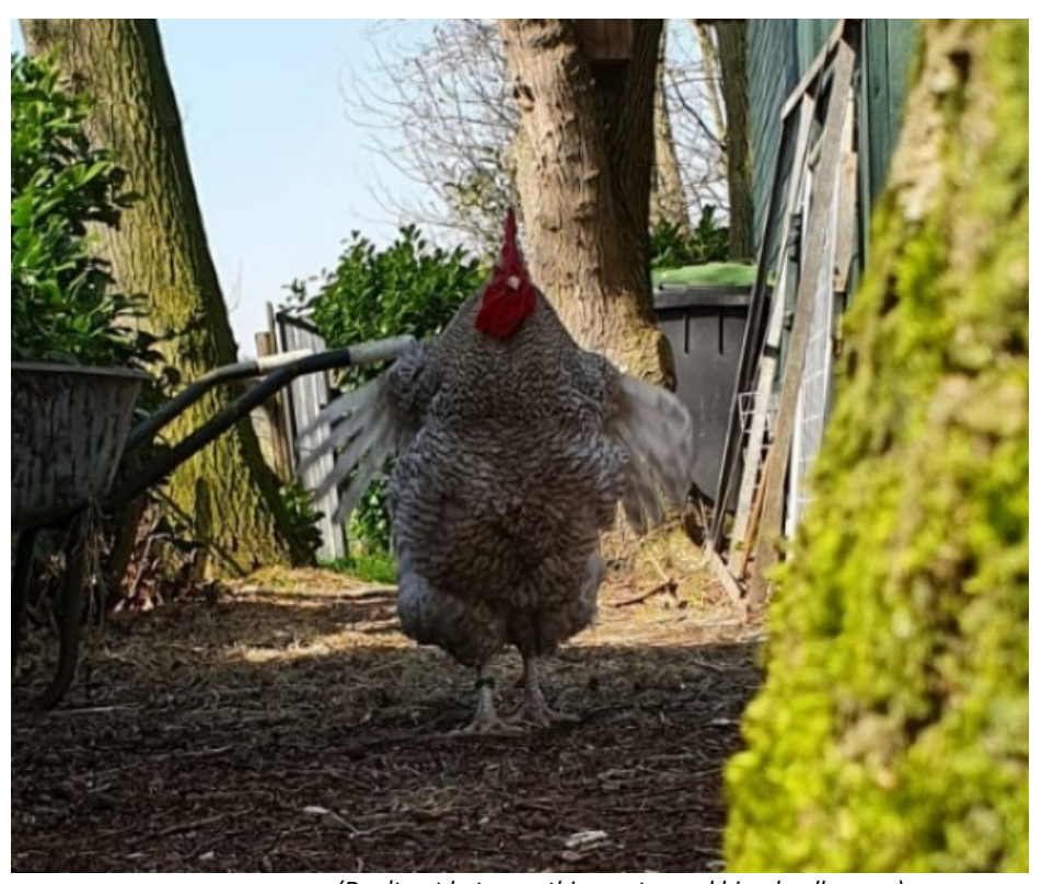
(Don't get between this rooster and his wheelbarrow)

Therefore, the board has decided to create a section called, "house, garden and kitchen snapshots". The idea is that in this section features some nice, funny or weird pictures of our breeds. If you have a fun photo which you are willing to share, please send it to the secretary for placement in the club magazine and/or the website and let us know that you agree for the ANHBC (GDPR) to use this photo.